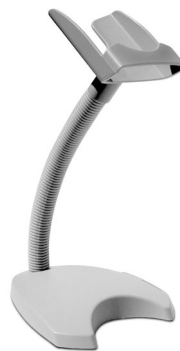
Gooseneck Tabletop Stand